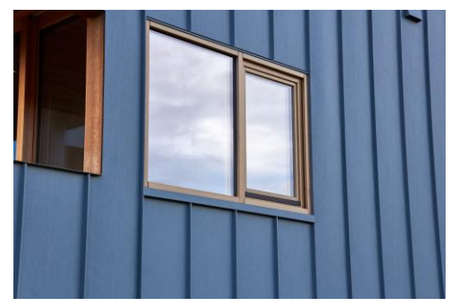
When used as a wall cladding

TARC Single Lock (TARC SL) may be used with a minimum roof gradient of 5 degrees.